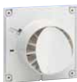
Backdraught prevention vanes fitted on discharge