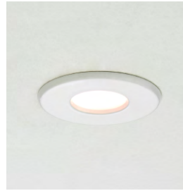
CODE: 1236013 (5658) FINISH: MATT WHITE