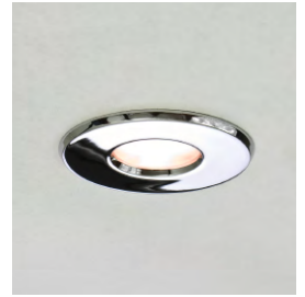
CODE: 1236014 (5659) FINISH: POLISHED CHROME