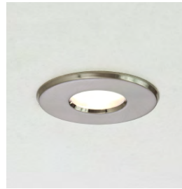
CODE: 1236015 (5660) FINISH: BRUSHED NICKEL

TO MAINTAIN THIS PRODUCT TO ITS BEST CONDITION, PLEASE VIEW OUR CARE AND CLEANING GUIDE ON THE SUPPORT SECTION OF THE ASTRO WEBSITE.