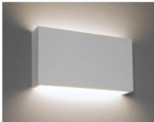
CODE: 1325005 FINISH: PLASTER

TO MAINTAIN THIS PRODUCT TO ITS BEST CONDITION, PLEASE VIEW OUR CARE AND CLEANING GUIDE ON THE SUPPORT SECTION OF THE ASTRO WEBSITE.