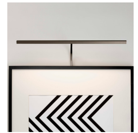
CODE: 1374015 (8286) FINISH: BRONZE

TO MAINTAIN THIS PRODUCT TO ITS BEST CONDITION, PLEASE VIEW OUR CARE AND CLEANING GUIDE ON THE SUPPORT SECTION OF THE ASTRO WEBSITE.