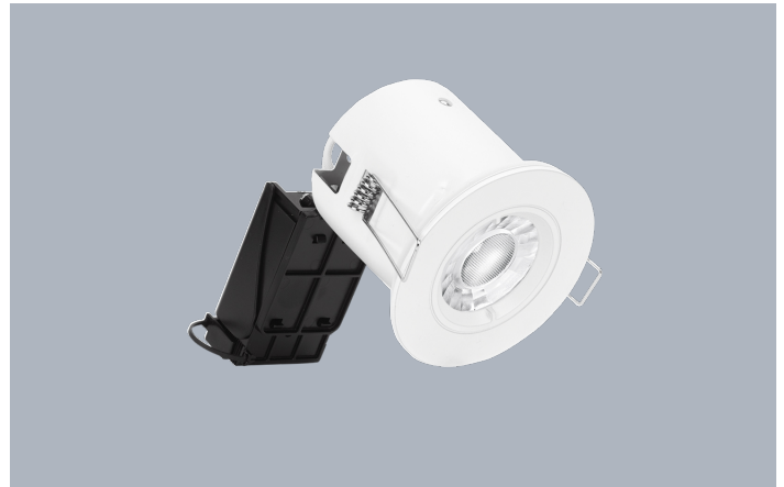
EFD™ PRO Fixed / IP Rated Professional Fire Rated Downlight