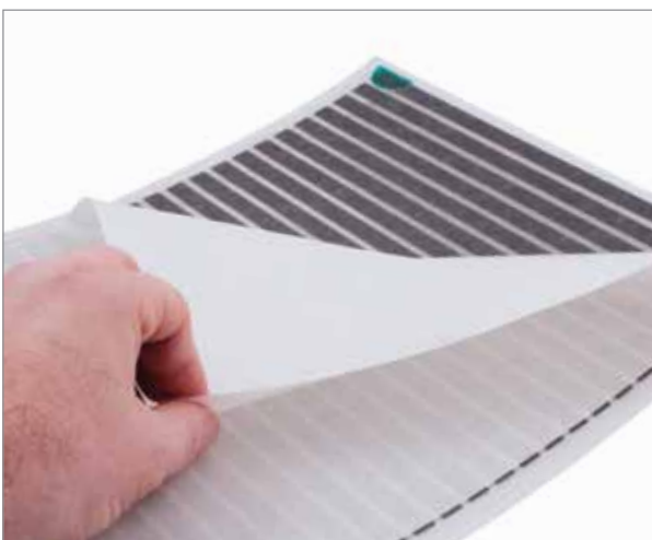
Peel-off adhesive backing