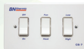
CS-7 switch for high/low/fan only settings