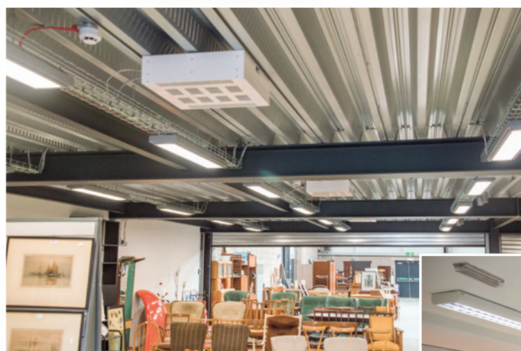
SMH heaters installed in an auction house