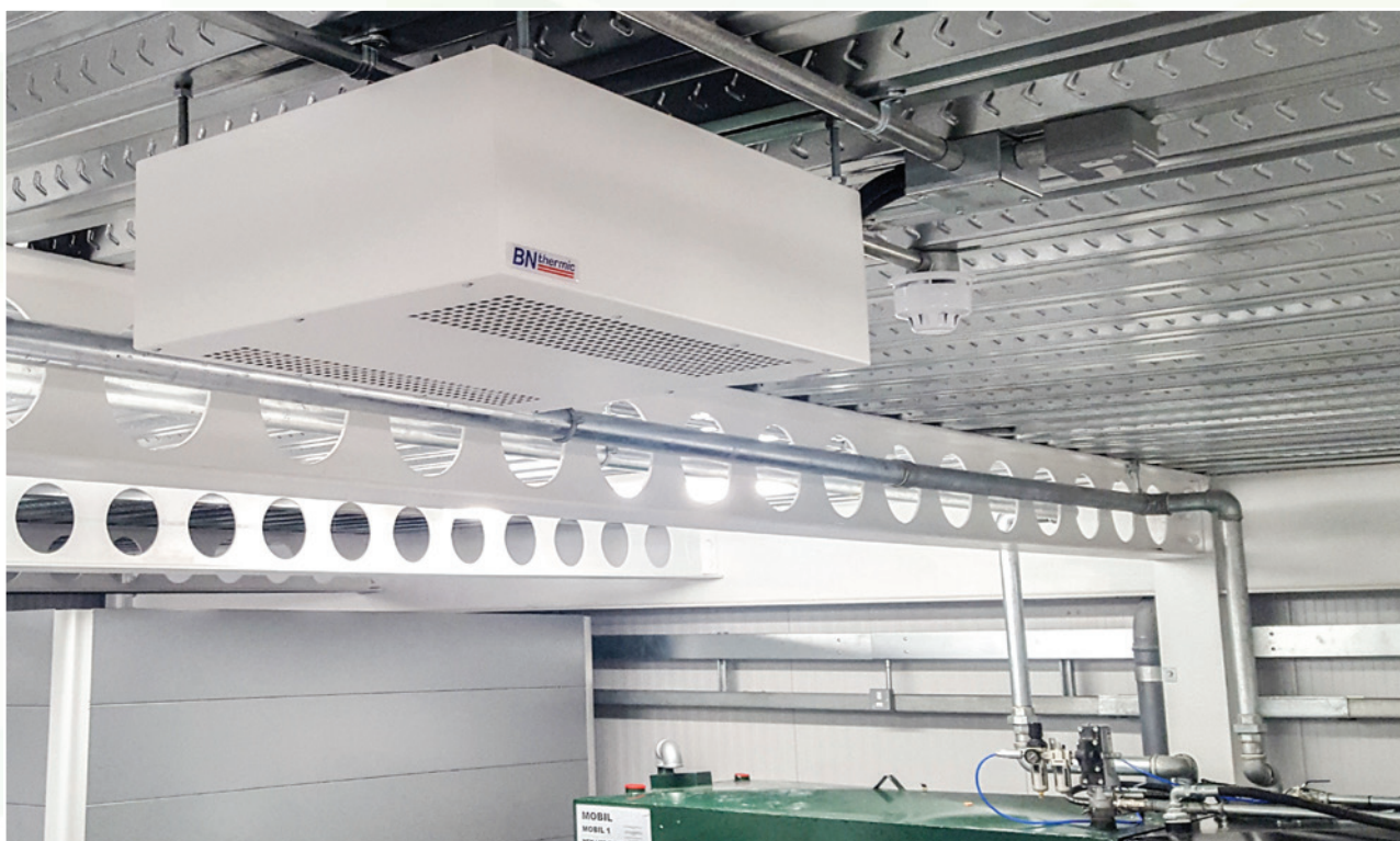
The rugged SMH is well suited to industrial applications