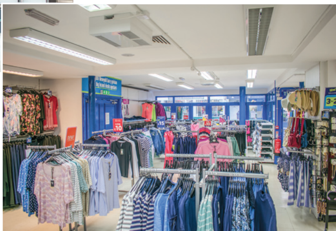
Warming customers in a factory outlet

FOR MULTI-HEATER SYSTEMS WE RECOMMEND OUR SYSTEM X - See PAGE 26