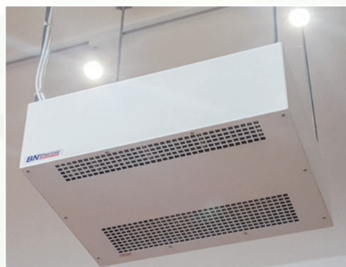
SMH heater suspended from drop rods

*Noise levels are factory tested not laboratory tested