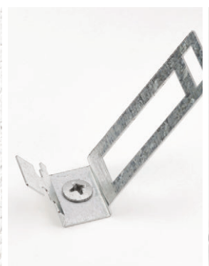
Conduit Clip 20 with D-Fixing