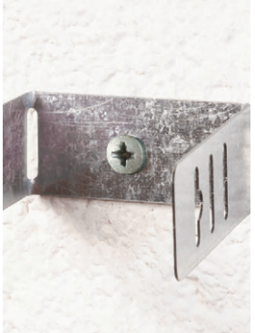
D-Fixing in Safe-D F-Clip 50