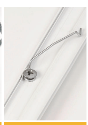
Spring Clip with D-Fixing

D-Fixings are fire-rated, with a 40mm long shaft and close threads which combine to provide exceptional performance. D-Fixings are ideal for securing D-Line fire-rated Safe-D ranges and other electrical installation equipment in popular substrates - including masonry, plasterboard / breeze-block, concrete, brickwork and wood.