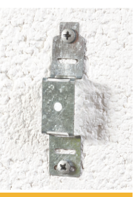
2x D-Fixings in Safe-D F-Clip 40