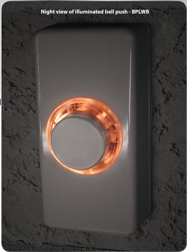
Night view of illuminated bell push - BPLWB