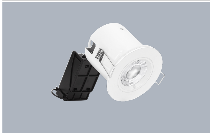
EFD™ PRO Fixed / IP Rated Professional Fire Rated Downlight